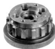
Optional Load Limiter